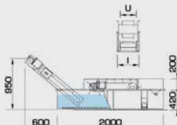
NV4 - NV5 - NV6 Nastro vasca particolari galleggianti Conveyor with cooling tank for floating parts